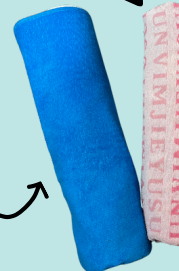
Pink Towel w/ letters