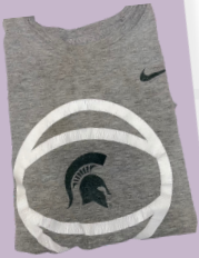
Grey Nike Spartans T-Shirt (Size 5)