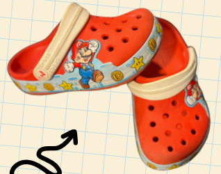
Mario Crocs (Size 8)