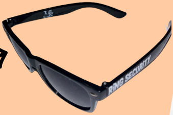
Bella Cuttery "Ring Security" Sunglasses