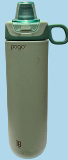
Light Green Pogo Water Bottle