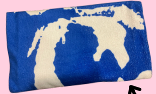
Blue Michigan "Unsalted" Towel