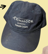
Navy Cranbrook Summer Camp Hat