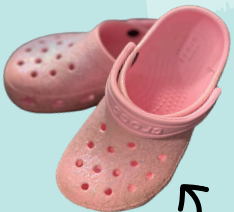
Pink Sparkle Crocs (Size 9)