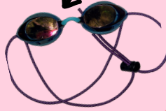
Blue & Purple Speedo Goggles