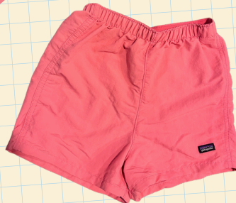
Pink Patagonia Shorts (Size 5T)